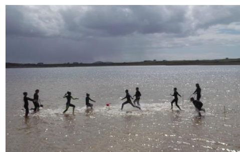
S1-3 Water Polo 'Tìre Style'