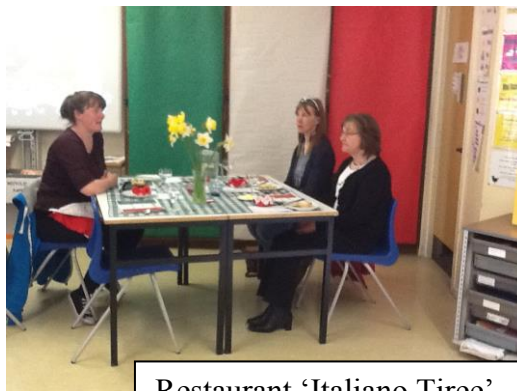
Restaurant 'Italiano Tiree' – exclusively open for one day only