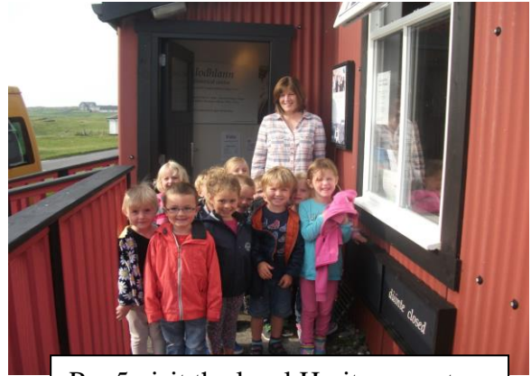
Pre 5 visit the local Heritage centre