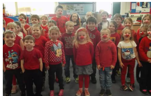
Red Nose Day