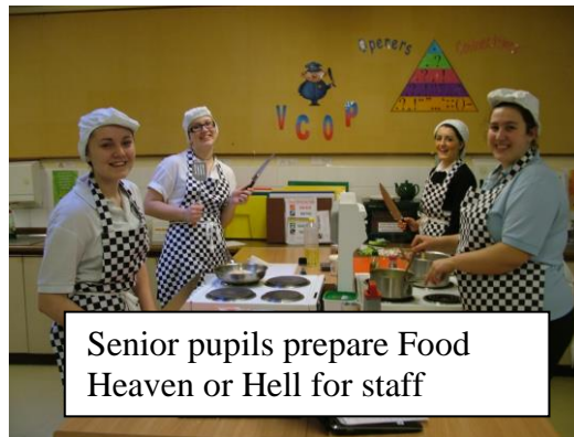
Senior pupils prepare Food Heaven or Hell for staff