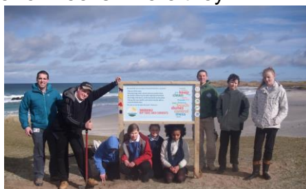
Tourist sign installed at Balevullin Beach