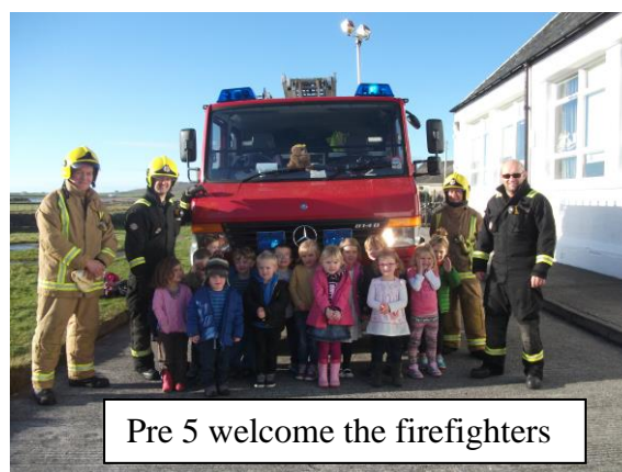
Pre 5 welcome the firefighters